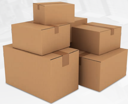
Plain Brown Shipper

We are an independent Australian manufacturer and converter of corrugated cardboard, cardboard boxes and other associated packaging products.