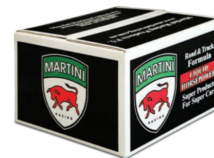
3 Colour Flexographic Regular Slotted Carton