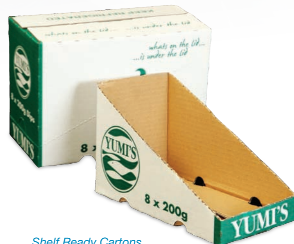
Shelf Ready Cartons

We can also custom design and make corrugated packaging to your particular specifications.