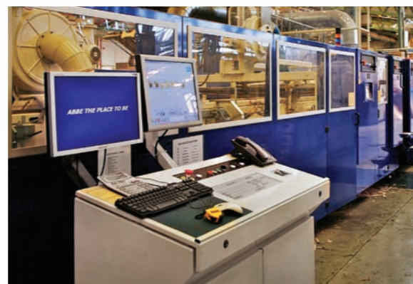
Flexo Folder Gluer

We look forward to discussing your requirements and show you how Abbe can tailor a solution to meet your Corrugated Packaging needs.