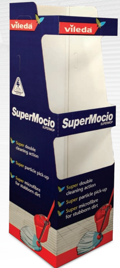
Flexo Printed Display