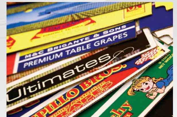
Various Flexographic Grape Lids

Our in-house design and manufacturing capabilities allow us to create a variety of products, suitable for a wide range of end-use markets.