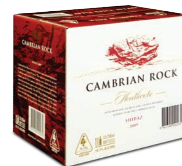
Litho-laminated Wine Carton

Our extensive range includes Printed or Plain, one or two piece trays and boxes as well as some products that are custom designed to meet the specific needs of the product or process. This may include particular coatings, waxing, hand holes/vent holes and inserts to name a few.