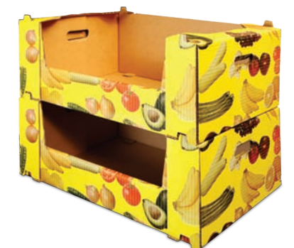
Hand Erected Printed Flexographic Shelf Ready Trays